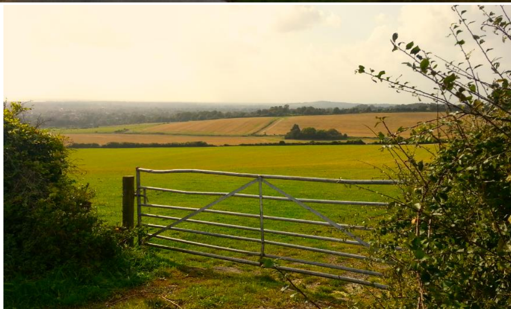
c. Views from gateway by footpath where Option D crosses Lambleys Lane, looking East