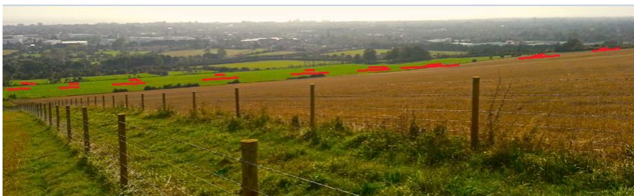
e. Views north and NW from Footpath 3134, taken just west of Lambleys Lane