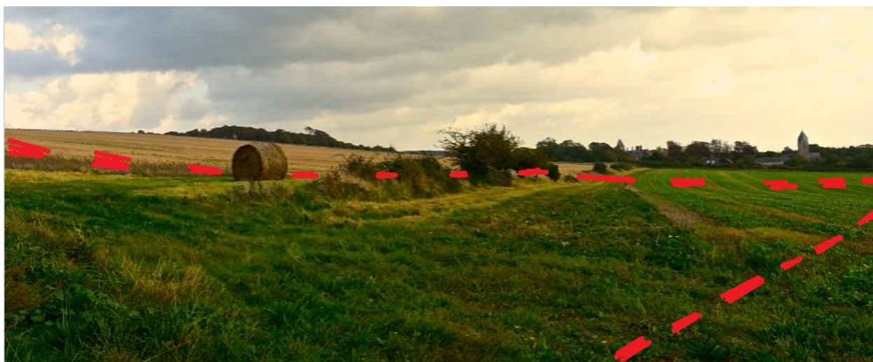
d. Views southwards from Footpath 2073 near The Mountain, Sompting